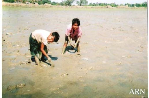
Two young girls catching fish on a bank of the Kaladan River

Dredging an estuary for the first time can trigger massive changes to an ecosystem, damaging many different species. Digging up material from the riverbed will first kill benthic creatures living in the river bed and will completely destroy the long established habitats of numerous species of crab. Next, the most serious damage will be caused by suspended sediments and a sudden increase in turbidity. This change will decrease light penetration to the area on which many plants depend. Furthermore, dredging leads to the extinction of smaller fish and forces bigger fish to leave the area.