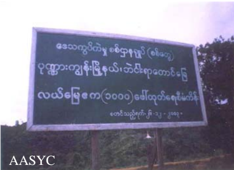
Sign detailing confiscation of 1,000 acres of farmland in Ponnagywan Tsp.

Due to mass deployment of battalions in the region, many acres of land have been confiscated from locals to build barracks, military outposts and other related infrastructure. Over 200 acres of farmland was recently confiscated from locals for the deployment of artillery battalions 375 and 377 in Kyauk Taw Township. According to locals, there have been similar cases throughout Paletwa Township. 21