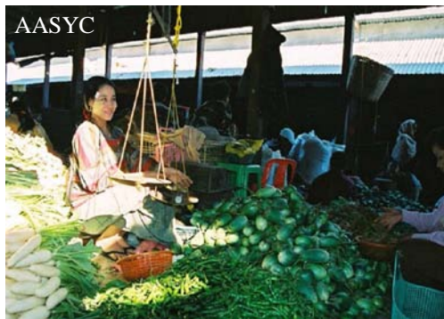
A local vegetables market– an essential source of income

“I used to go into the river everyday with my brother to catch fish and find water snails for food. This is how we feed my family,” he added.