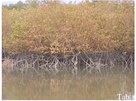
Threatened mangrove forests on the bank of the Kaladan River