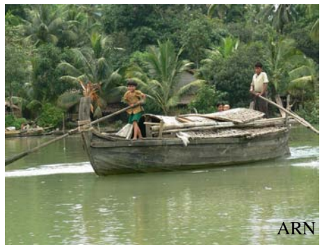
A typical family trading boat along the Kaladan River