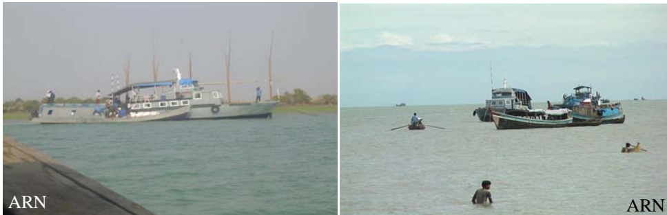
A few of many Navy checkpoints along the Kaladan River

As well as the soldiers coming in from other parts of Burma, many are recruited locally, often by force. There have been reports from areas all along the river this year of youths being forced into the army.