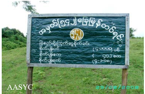
40 acres of Castor Oil Plantation Garden in Kyauk-phru Tsp confiscated by LIB 542

The proposed site for the new seaport is situated in a highly residential area, and it is possible many citizens will be forced to relocate. We can predict from past experience, that these people will receive no help from the authorities to find new homes. Many locals are also concerned about Site-tway general hospital, which is situated less than 50 metres from the sea and may also be removed.