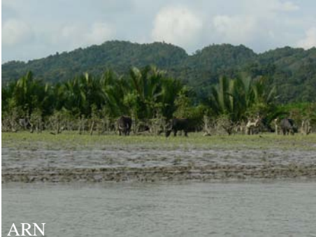
Buffaloes eating grass along a bank of the Kaladan River

natural environment for food supplies, these areas are perhaps the most important of all. The estuary of the Kaladan River is no different; it is home to thousands of species, many of which have never been studied before and could hold a wealth of biological information. For the locals, these species play a much more urgent role, as they are the sole source of food for hundreds of thousands of impoverished families.