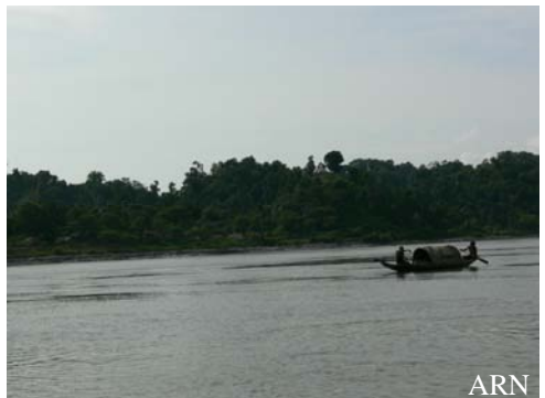
People's livelihoods and forests along the Kaladan River

The military junta has shown before it has little regard for ecologically important areas and it is likely nothing will be different here. A 62 km stretch of forest will have to be cleared so that asphalt can be laid down, encroaching on the natural habitats of many already endangered species.