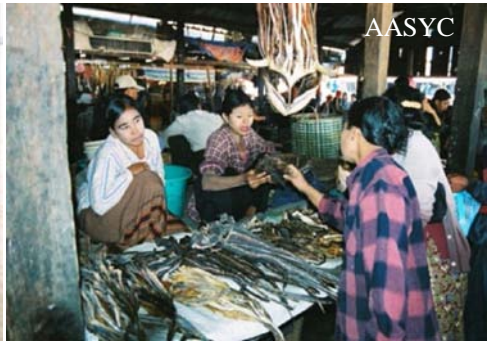
A local fish market – an essential source of income

The project will allow greater access for foreign companies and large ships. However, it will put further restrictions on already strained local businesses. To allow foreign vessels access to the port at Site-tway at all times, it is likely that fishing will be prohibited in an area where hundreds of locals make their living and get their daily food. This has already happened in Kyauk-phru where a port was recently built for the Shwe Gas Project by Chinese companies. 19 Similar restrictions are likely to be implemented all the way up the Kaladan River, making travel and the transport of goods almost impossible.