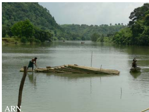
People's livelihoods up-river on the Kaladan