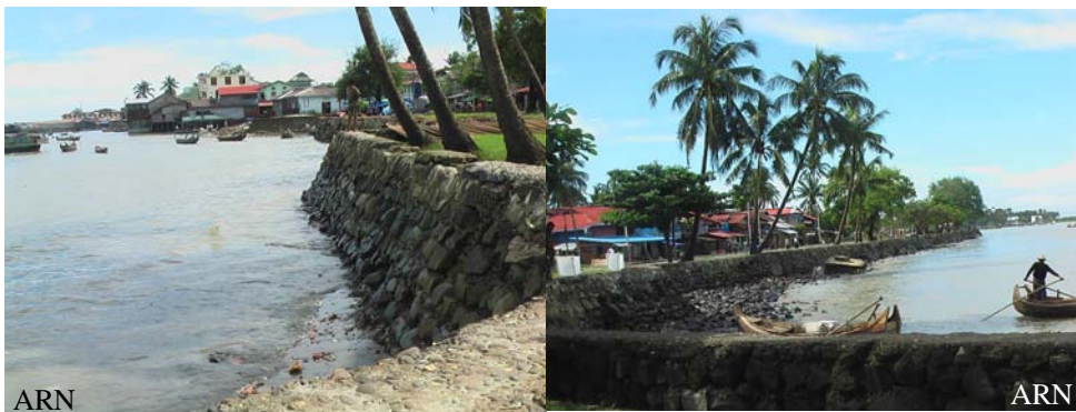
Proposed Port area of Kaladan Multi-Modal Transit Transport Project along the Strand Road of Site-tway

These species are important not only for scientific study but also as the main source of food for many local residents. To allow large vessels to reach the seaport at Site-tway, an approach channel will need to be created. Therefore, 12,216 cubic metres of material from the bottom of the sea will be dredged (dug up). A further 549,738 cubic metres directly around the port area will also be dredged. The majority of the dredged material (waste) will then be dumped at sea. 26