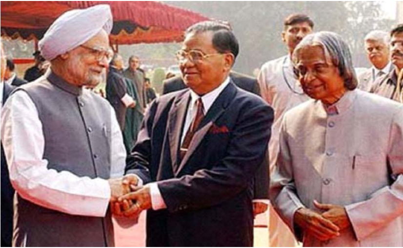
2004 -General Than Shwe (centre) becomes the first senior Burmese official to visit India for over 20 years

India's relationship with Burma is also largely based on a need to counter China's influence in the region. China has recently become Burma's largest foreign investor and has built its own port in Kyauk-phru, just 40 km from Sitaway.