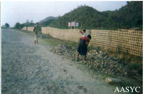
These photographs were taken at previous development sites in Arakan State