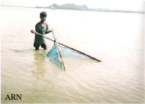
A young boy fishing in the Kaladan River