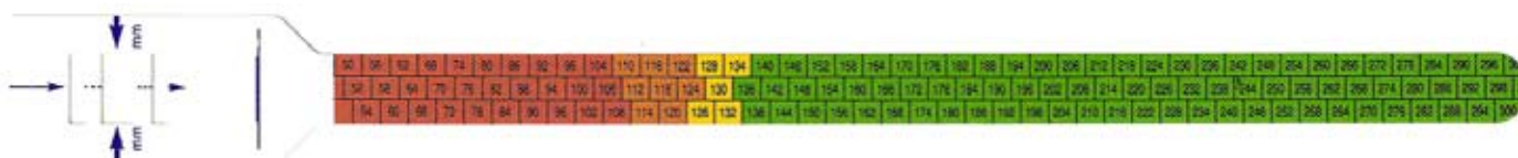
Figure 3 shows a mid-upper arm circumference (MUAC) colored plastic strip, which PHR investigators used to measure acute malnutrition in 143 children ages 6-59 months at the Kutupalong unofficial camp, near Cox's Bazar, Bangladesh.