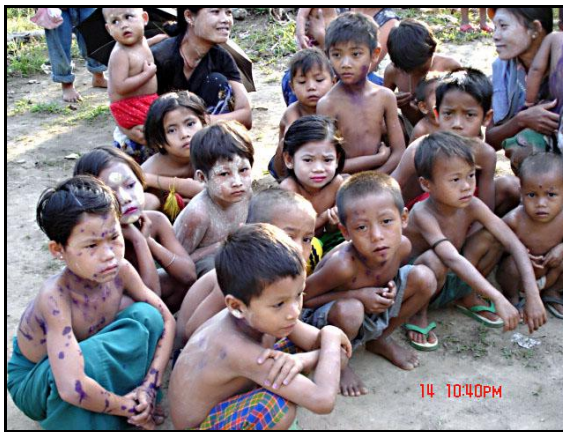
Malnourish children in Mon State-December 2006