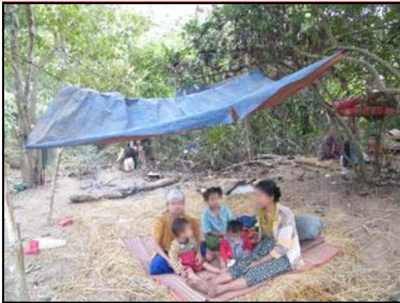
This photo, taken on November 26 th 2009, shows a temporary hiding site in Bu Tho Township, Karen State, established by residents of Pi--- village in neighbouring Dweh Loh Township. Families fled Pi--- after three days of abuse by LIB #219 soldiers. Adults were forced to perform forced labour while children and infants were made to sit in the sun in the camp without food, water, or parental care, in conditions amounting to torture.