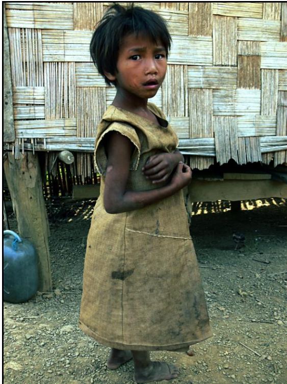
A malnourish child in Paletwa Township, Chin State, Photo by Khin Tun 2009