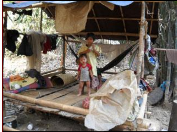
This photo, taken on March 20 th 2010, shows children living in a hiding site in Ht--- village in the Ma Noh Roh area of T'Naw Tha Ree Township, Tenasserim Region. Families in hiding in Ma Noh Roh told KHRG that they fled after soldiers from Tatmadaw IB #17 set up camps in their area in March 2010 and looted villagers' property and animals. Civilians in hiding in Ma Noh Roh have to be ready to flee on short notice because Tatmadaw soldiers are active nearby.