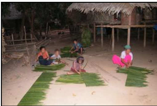
This photo, taken on February 7 th 2010, shows women and children working at night in their village, weaving thatch to meet an order issued by a local DKBA unit in Bu Tho Township. Residents of villages in central Papun District are frequently ordered by local SPDC or DKBA authorities to find, fabricate and deliver thatch and other building materials to their camps.