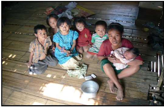
Lack of family planning awareness, food insecurity, lack of basic healthcare are serious burdens for family- Paletwa Township, Chin State- Photo by Khin Tun 2009