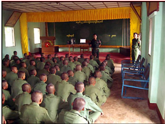
Children among adult army at the military training-at Tha Ton 9- 2008