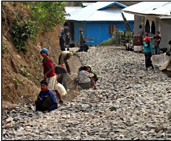
Forced labour at Calthawng village, Rezua, March 2011 township (Matupi-Hakha road)