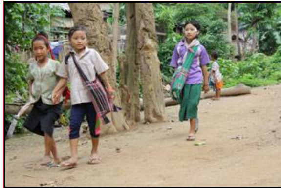
Children residing in Ee Thoo Hta IDP camp in Pa'an District, Karen State, walk to school during the rainy season in July 2009. Most of these children have come from villages in the mountains of northern Karen State. For some the school at Ee Thoo Hta is their best opportunity for education. The current camp registration includes 472 children aged 1 to 5 years. The head teacher of Ee Thoo Hta High School told KHRG that there were over 500 children aged 6 to 15 years attending the school.