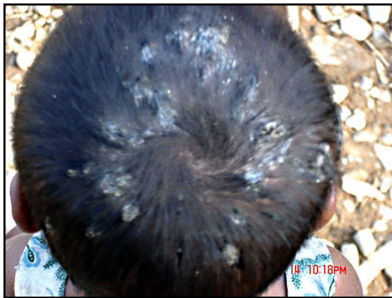
Skin problems are rampant among children