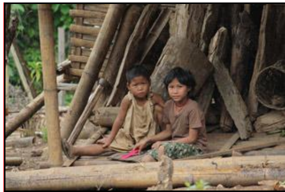
This photo, taken on May 30 th 2010, shows children living in D--- village, Lu Thaw Township, Papun District. These children came to D--- in 2009 when their families fled Tatmadaw attacks in Yeh Mu Bplaw village. Villagers told KHRG that many people try flee to D--- when they have to leave their villages, because their children have good opportunities to continue their education there.