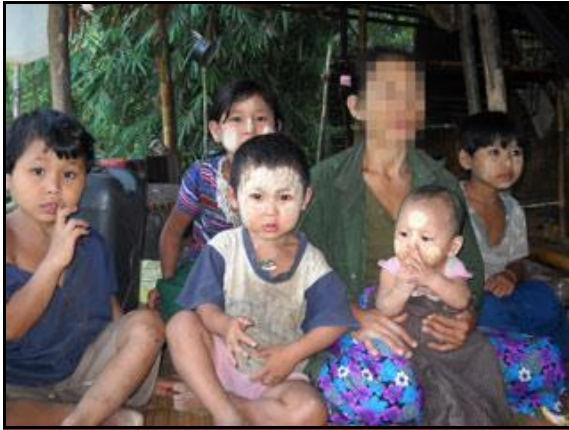
This photo, taken on March 20 th 2010, shows one of the families currently in hiding to avoid Tatmadaw attacks at La--- in Tenasserim Region. Many families in the site reported that they were confronting food shortages; they told KHRG they planned to attempt to buy food in villages in Tatmadaw-controlled areas, but were afraid of what would happen to them if they were captured by Tatmadaw soldiers.