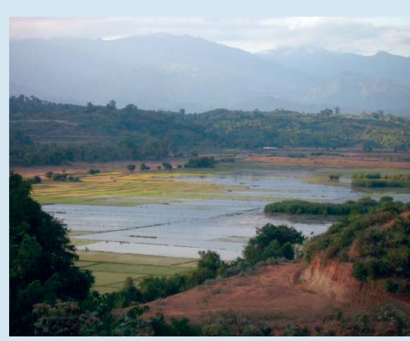
Paddy fields near the dam site will be inundated

Once the dam is built, water levels downstream will be unpredictable. There will be periods of water shortage, impacting riverside agriculture, as well as boat transport and trade, while releases of water from the dam will cause sudden surges, threatening the safety of those carrying out daily tasks along the river banks.