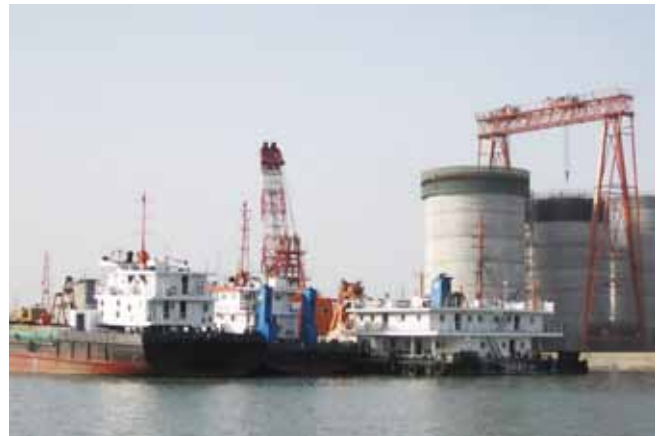
Construction of China's seaport at Madaya Island, Kyauk Phyu Township.

A Free Trade Agreement between China and the ASEAN nations signed in 2010 created further incentives for trade between the nations. The Kyauk Phyu project will be China's largest SEZ project in Southeast Asia and according to the feasibility study, the ASEAN market will be targeted through "export-oriented" manufacturing and processing industries.