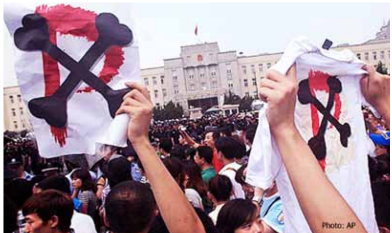
In September 2011, Chinese authorities ordered a petrochemical plant in Dalian to shut down immediately after tens of thousands of protesters marched through the streets of a nearby city, demanding the factory be relocated.

Complaints were also made that the Da Xie SEZ management had withheld information about the leakage and continued production for three days as if nothing had happened. Following an investigation in 2007, an Environmental Impact Tracking Evaluation report stated risks further chemical leakage and oil spills had still not been mitigated. 8