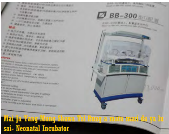
Mai Ja Yang Mung Shawa Tsi Rung a mata mai da ya lu sai- Neonatal Incubator