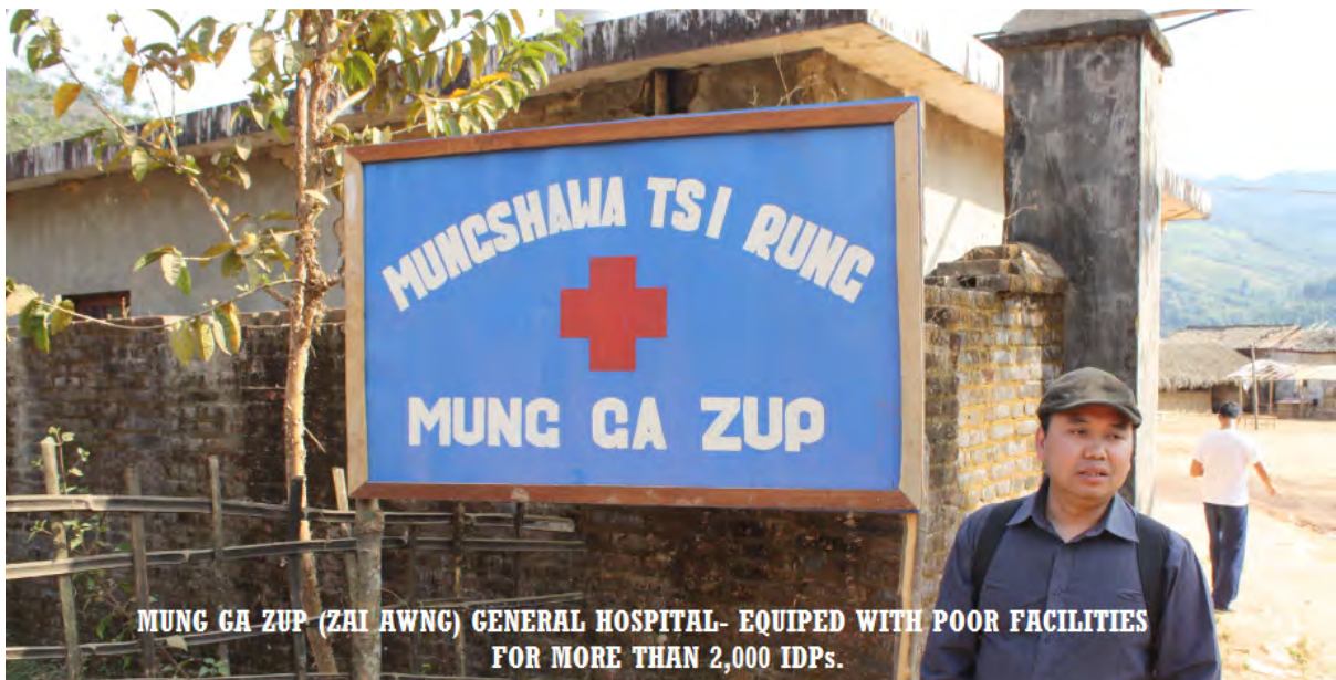
MUNG GA ZUP (ZAI AWNG) GENERAL HOSPITAL- EQUIPED WITH POOR FACILITIES FOR MORE THAN 2,000 IDPs.