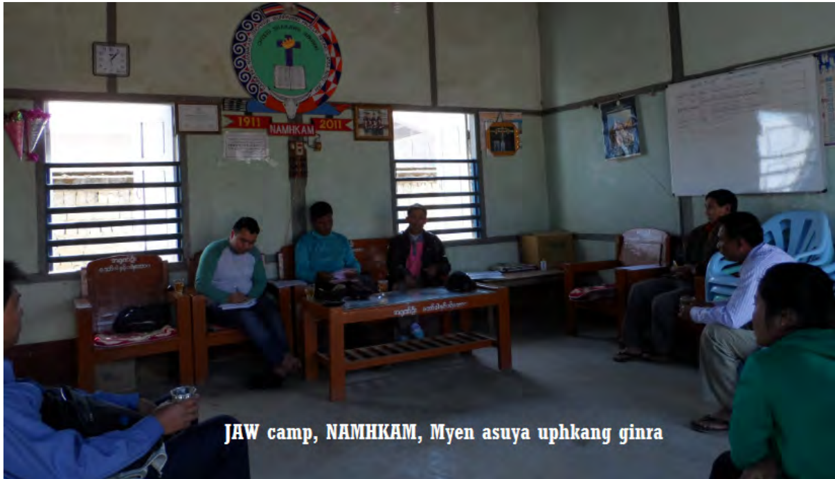
JAW camp, NAMHKAM, Myen asuya uphkang ginra