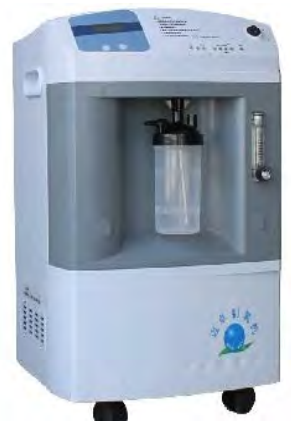
Oxygen Generator for Maga Yang IDP clinic