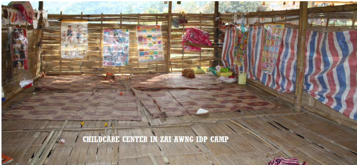
CHILDCARE CENTER IN ZAI AWNG IDP CAMP