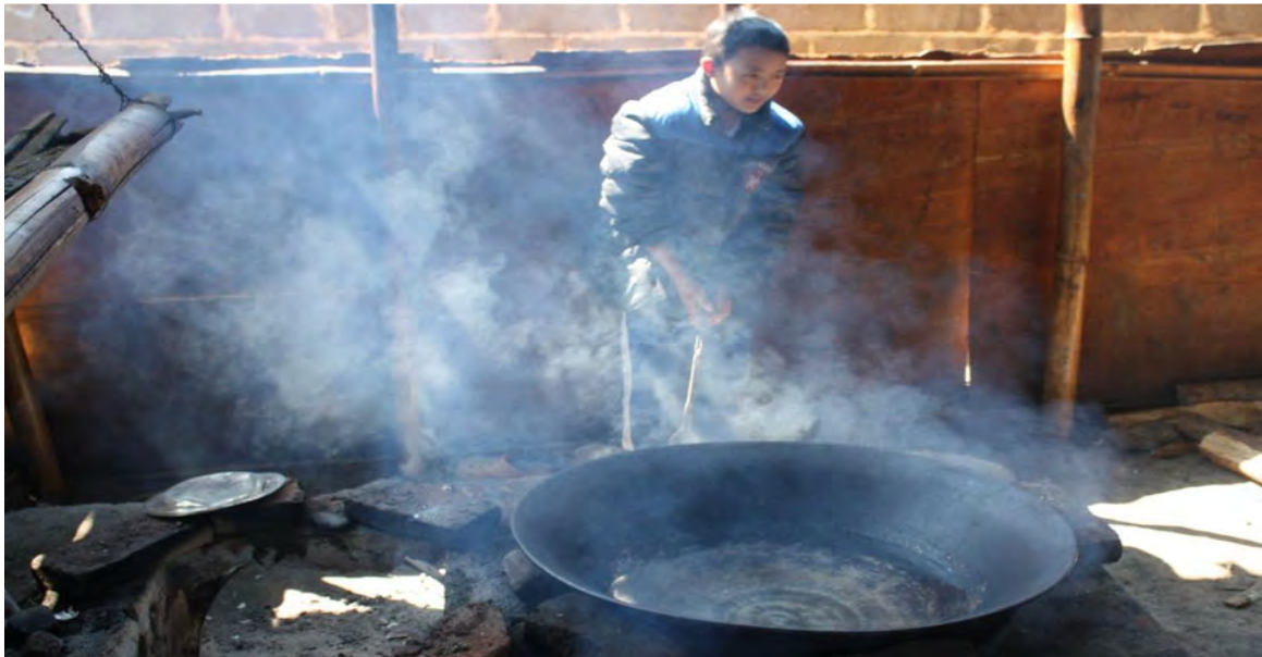
Orphanage IDP children preparing to cook their meal