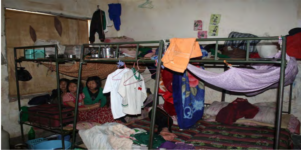
IDP children without their parents in Pa Kahtawng IDP camp, Mai Ja Yang