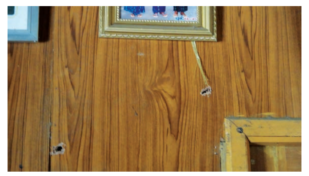
Arbitrary shooting by Myanma Tatmadaw

them to Byuha hill. They called them out and made them go along with them. Those men led us along the way and we followed down the hill. They made us walk in groups of ten or twelve men between each of their platoons.