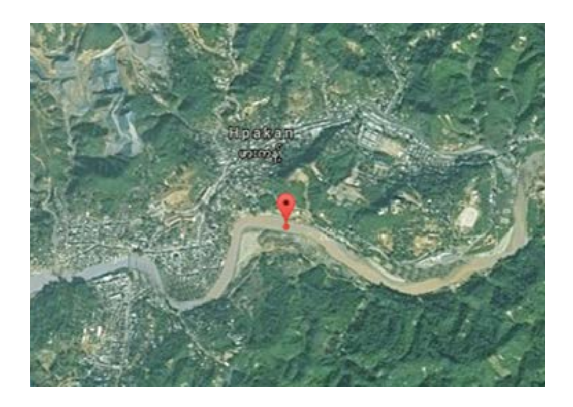
***Sut Ngai Yang village is located in Hpakant Township, Kachin State, over 90 miles from Myitkyina. The location where Ja Seng Ing was injured is N 25'37.202", E 096'18.826" 1002 Ft GPH. The place where Ja Seng Ing died is N 25'37.256", E 096'18.897" Ft.