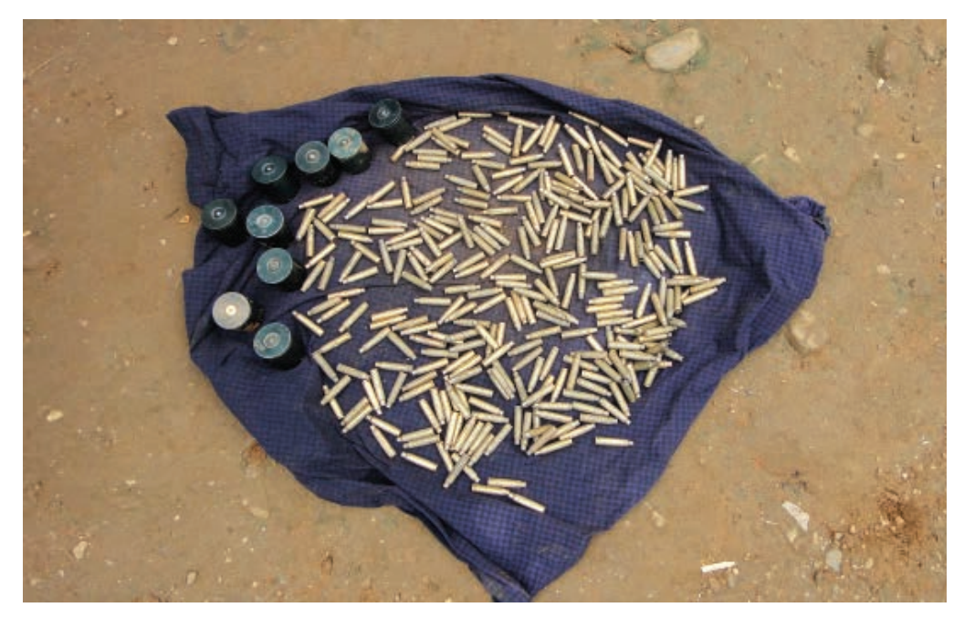
Myanma Tatmadaw's Boom and Bullet

When they yelled at the school girls, the teacher came out from her hiding place. The teacher being the oldest told them that she was with the school girls who lived in the upper part of the village. The soldiers ordered them to go away. But, when the teacher looked back, my daughter was not able to rise up and walk anymore.