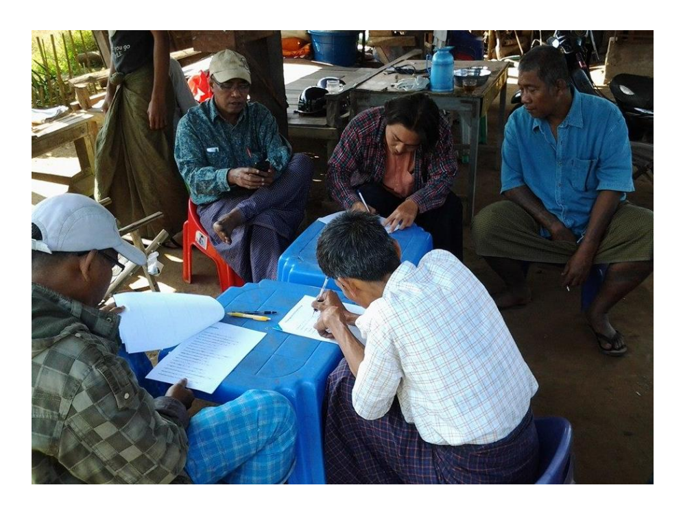
FPPs complete the surveys whilst the data collector looks on

In areas where the data collectors were unable to administer the survey with the FPPs, surveys were distributed at collection points to be self-administered by the FPPs and returned back to AAPP. Family members filled in surveys on behalf of deceased FPPs. In total, approximately 5,000 surveys were distributed; thus far, AAPP has received back 2,849 surveys.