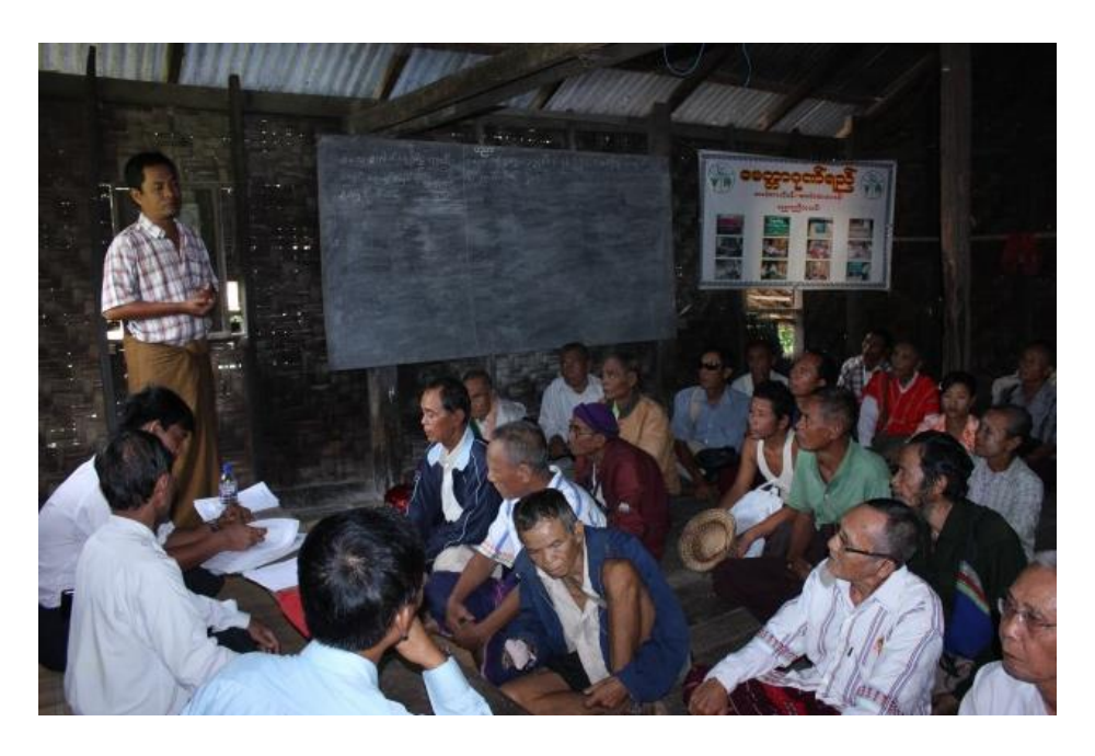
A data collector explains the Documentation Project to FPPs in Kyaunggon

In areas where the data collectors were unable to administer the survey with the FPPs, surveys were distributed at collection points to be self-administered by the FPPs and returned back to AAPP. Family members filled in surveys on behalf of deceased FPPs. In total, approximately 5,000 surveys were distributed; thus far, AAPP has received back 2,849 surveys.