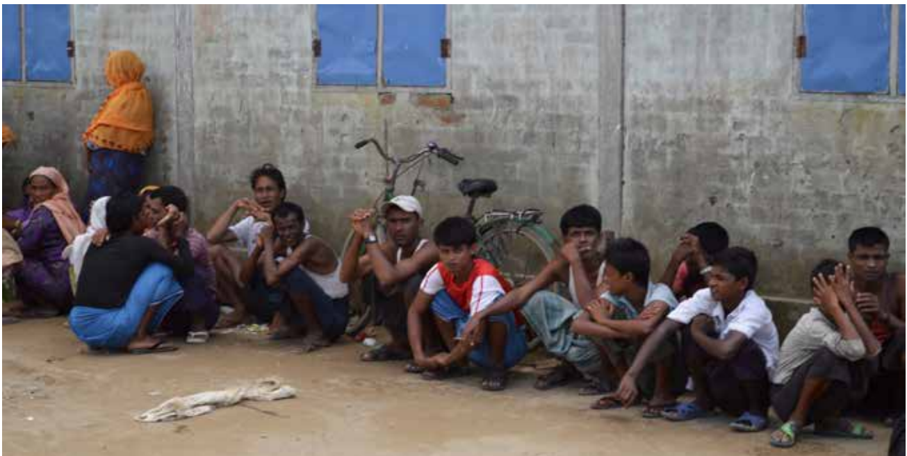
Rohingya wait for monthly rations in Dapaing IDP camp, Sittwe. Freedom of movement restrictions prevent many Rohingya, particularly those displaced, from accessing livelihoods.

The policy recommendations included in this report were developed by APHR members – lawmakers in parliaments across Southeast Asia, who possess unique expertise and knowledge of the policymaking process in ASEAN countries.