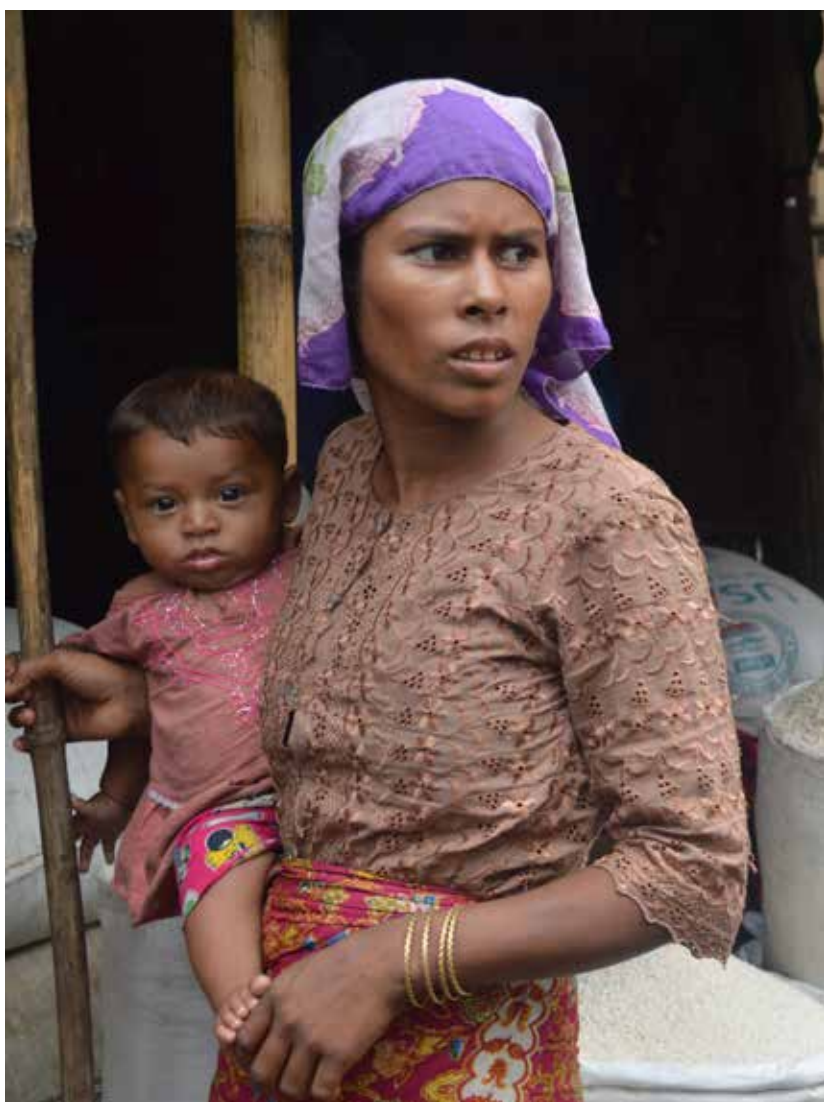
A Rohingya woman and her child stand outside a food distribution center in the Sittwe IDP camps. Rohingya IDPs are concerned about starvation as they struggle with little to no access to government services.

Statements like these from government officials reinforce existing perceptions among Rohingya that there is no hope for their future in Myanmar. Rohingya told APHR that they have little trust in the government, citing their lack of access to citizenship, ongoing rights abuses perpetrated by government forces, and the absence of the rule of law. In practice, they are also excluded from government service. There are few, if any, Rohingya working in local government in northern Rakhine State, even though Rohingya make up between 90 and 95 percent of the population there. 19