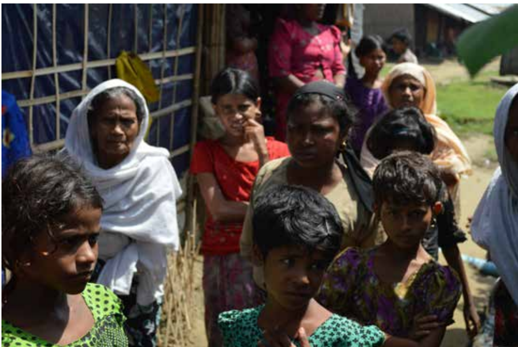
Rohingya women and girls gather in the Sittwe IDP camps. Female IDPs face a unique set of hardships, and in many cases must work to support their children single-handedly.