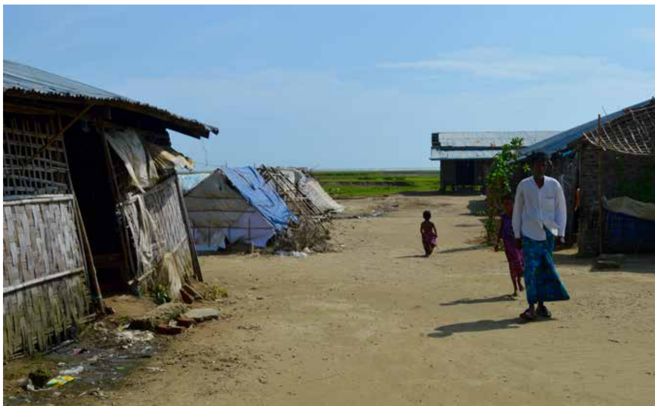
Rohingya in Aung Daw Gyi IDP camp in the Rakhine State capital, Sittwe. Nearly 140,000 Rohingya live in IDP camps throughout the state, many with extremely limited access to essential services.

Other international actors, including the UN, the EU, and the United States, have a role to play as well. In addition to pressuring the Myanmar government to end its policies of oppression, they must work to convince ASEAN member states to more robustly address the drivers themselves.