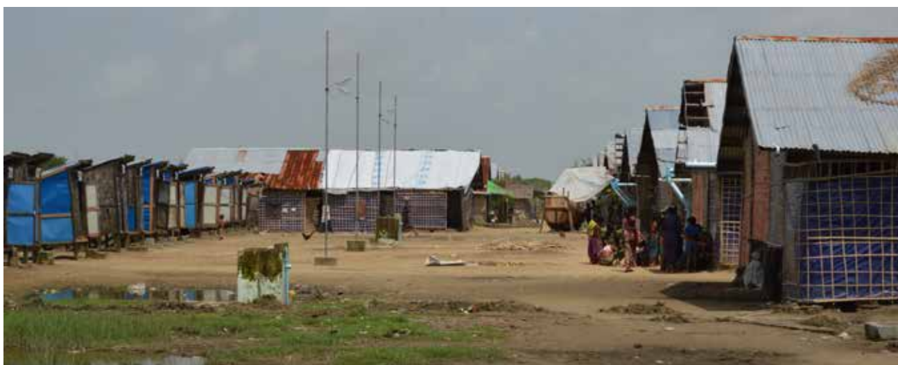
Rohingya IDPs stand outside makeshift shelters in Dapaing IDP camp, Sittwe. Many shelters are inadequate in the camps, one of a number of hardships faced by displaced Rohingya.

Rohingya IDPs are concerned about starvation. Community leaders in Say Tha Mar Gyi IDP Camp told APHR that only about half of the IDPs there are registered with the World Food Programme and eligible to receive food aid. In all of the camps APHR visited, the rations for August 2015 did not arrive until the end of the month, and families had to cope for several weeks of severe shortages. IDP families complained that rations were insufficient and that they had to find other food with which to supplement them. Because very few people have a source of income, families must sell some of their rice ration to pay for other types of food and necessary items like firewood for cooking. The family-level monetization of food aid further decreases the amount of nutrition available.