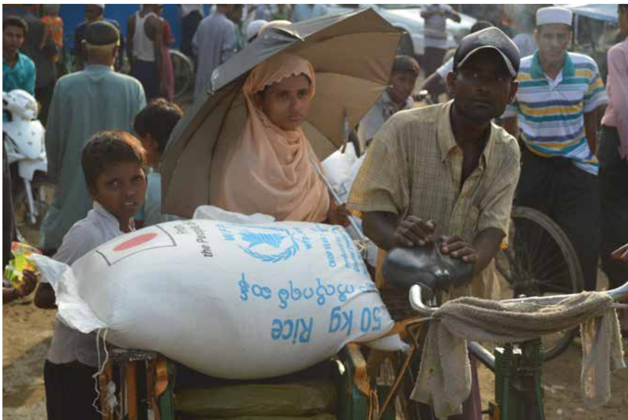
A displaced Rohingya family in Sittwe collects their WFP rations for the month. Stripped of their rights and without access to work, many Rohingya are dependent on international aid for survival.

Earlier this year APHR assessed the ongoing state-sponsored abuses and systematic discrimination against Rohingya and concluded that they indicate a high risk of genocide, war crimes, and crimes against humanity. 5 The situation in Rakhine State has only deteriorated since. Disenfranchisement, combined with economic depression, lack of access to livelihoods, and dire humanitarian conditions, will drive increasing numbers of Rohingya to flee the country.