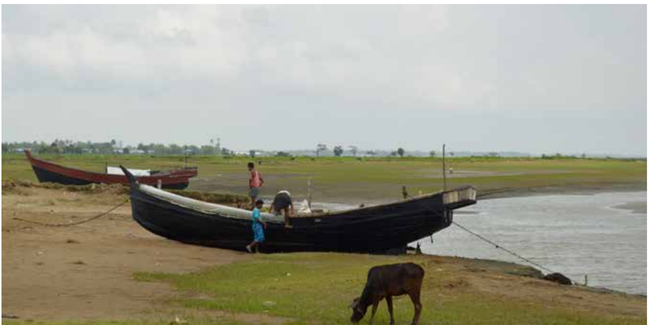
Boats docked near Aung Daw Gyi IDP camp in Sittwe. In recent years, Rohingya have increasingly taken to fleeing Rakhine State by sea, often falling into the hands of human traffickers.

In recent years, Rohingya have increasingly taken to fleeing Rakhine State by sea, in hopes of seeking refuge in Malaysia, Indonesia, and other ASEAN states. In 2009, the Thai Navy found several fishing boats filled with starving Rohingya off the coast of Thailand. These individuals were towed back out to sea and later arrived on the Indian-held Andaman Islands. 34 The Arakan Project estimated that a total of 6,000 Rohingya fled Rakhine State on boats in 2008. 35