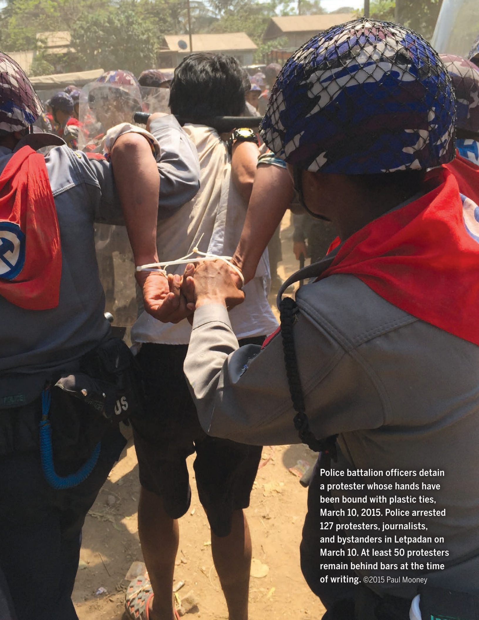
Police battalion officers detain a protester whose hands have been bound with plastic ties, March 10, 2015. Police arrested 127 protesters, journalists, and bystanders in Letpadan on March 10. At least 50 protesters remain behind bars at the time of writing.