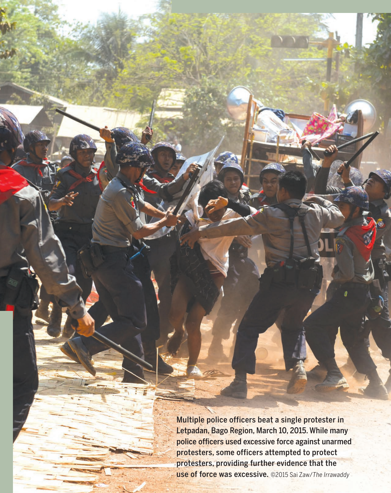
Multiple police officers beat a single protester in Letpadan, Bago Region, March 10, 2015. While many police officers used excessive force against unarmed protesters, some officers attempted to protect protesters, providing further evidence that the use of force was excessive.