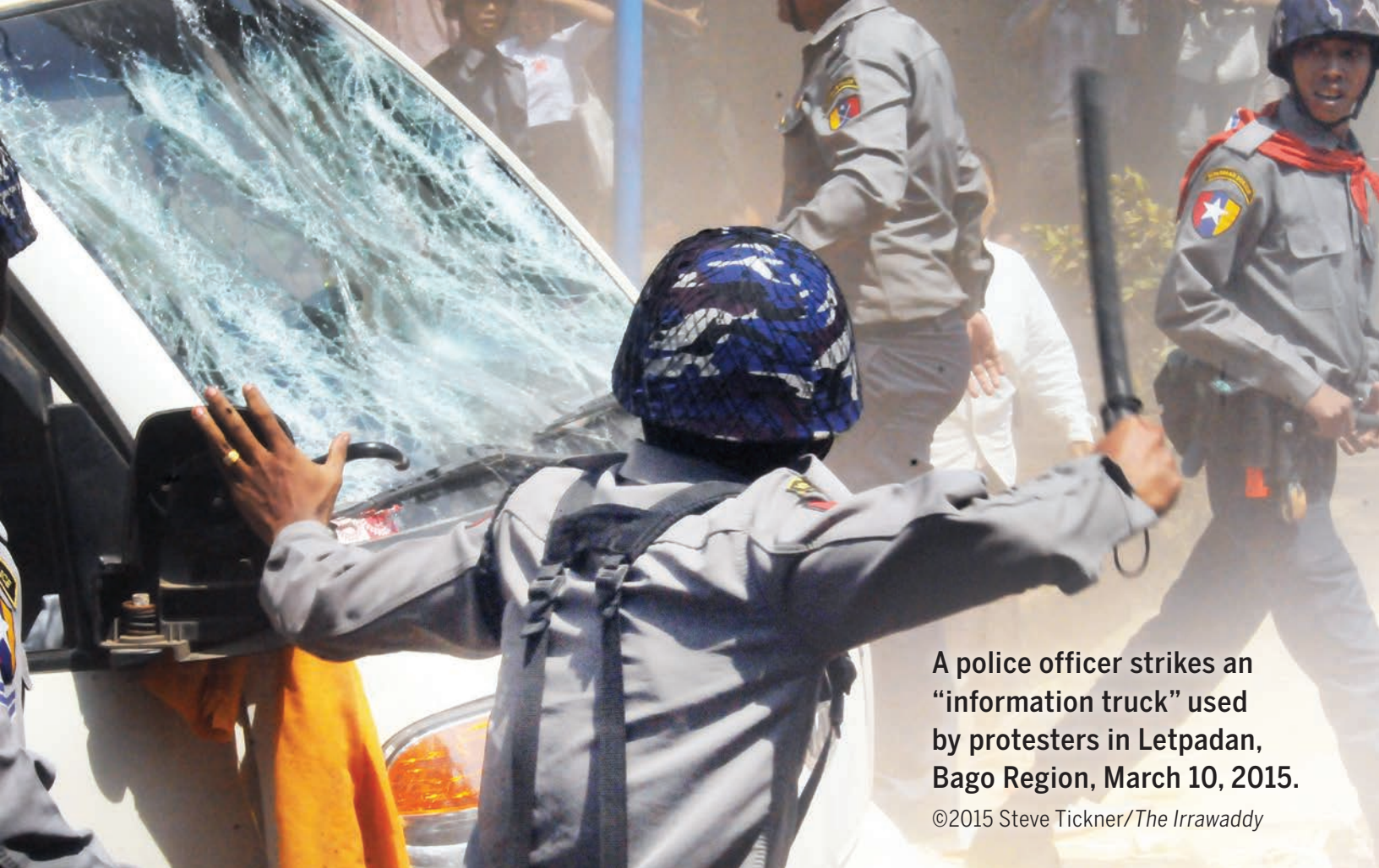
A police officer strikes an “information truck” used by protesters in Letpadan, Bago Region, March 10, 2015.