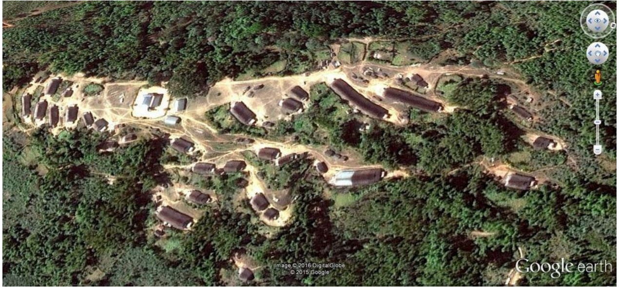
Parng Lom village from Google earth