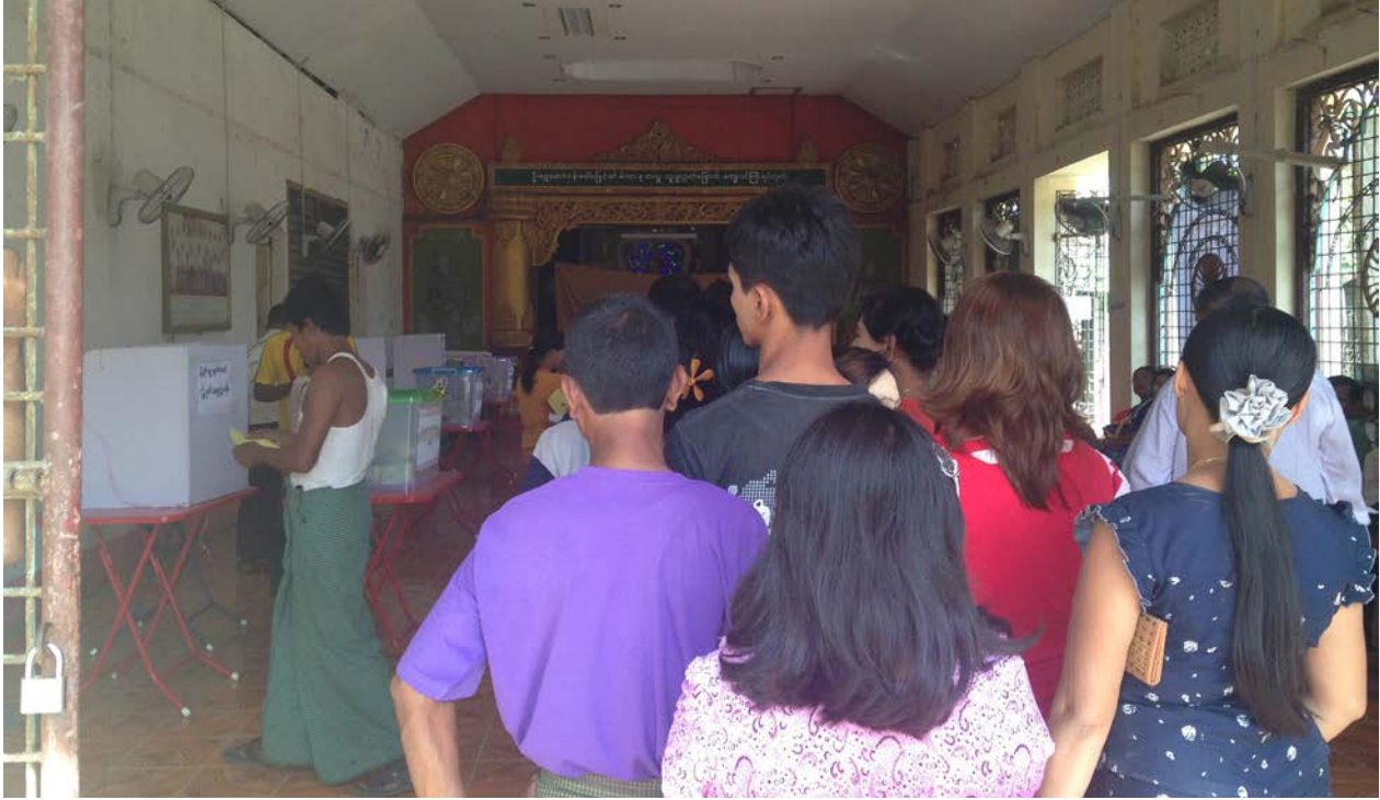
Rakhine citizens line up to vote in Myanmar's national elections, Sittwe, Rakhine State, November 8, 2015. In 2015 Myanmar President Thein Sein stripped Rohingya of their right to vote.