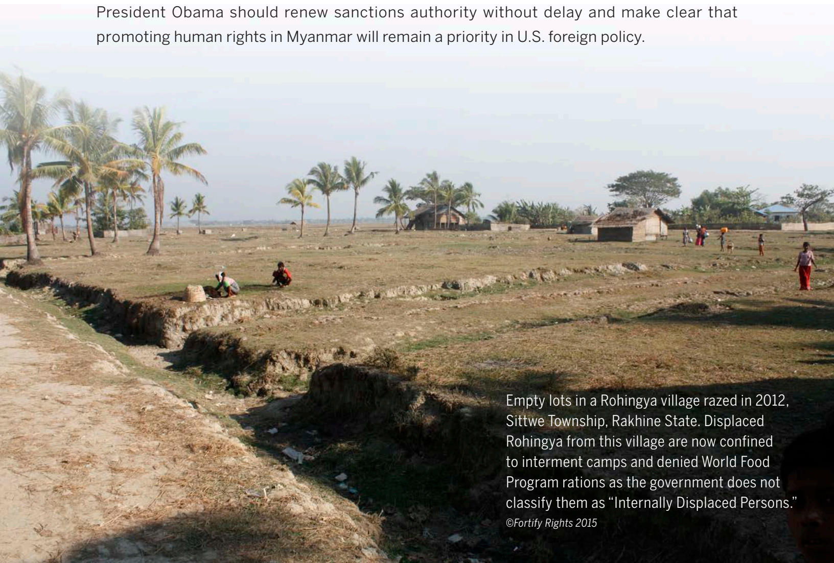
Empty lots in a Rohingya village razed in 2012, Sittwe Township, Rakhine State. Displaced Rohingya from this village are now confined to interment camps and denied World Food Program rations as the government does not classify them as "Internally Displaced Persons."

President Obama should renew sanctions authority without delay and make clear that promoting human rights in Myanmar will remain a priority in U.S. foreign policy.