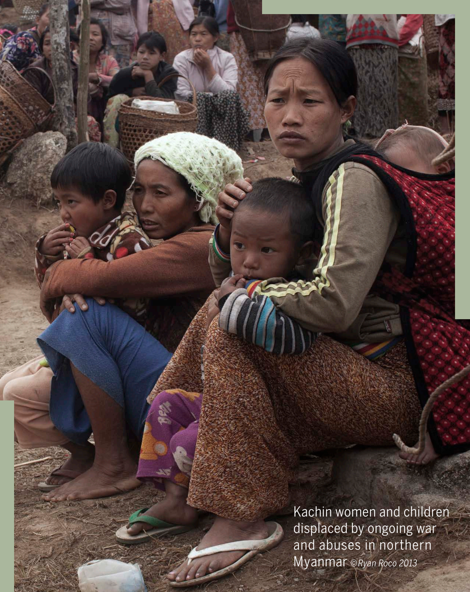
Kachin women and children displaced by ongoing war and abuses in northern Myanmar