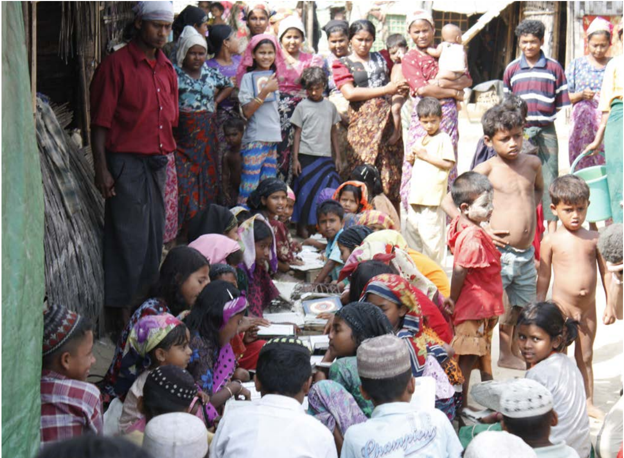
Rohingya Muslim children in an overcrowded internment camp in Sittwe Township, Rakhine State.

Most recently, at least 24 displaced Muslims, including nine children, drowned in Sittwe Township while attempting to travel by boat from Sin Tet Maw internment camp in Pauktaw Township to Thae Chaung internment camp in Sittwe Township to purchase food and access medical care that is otherwise denied to them in Sin Tet Maw. Survivors of the incident, other Rohingya, and U.N. officials and staff confirmed that Myanmar authorities still restrict overland travel of Rohingya and Kaman Muslims throughout Rakhine State—in many cases, the restrictions require interned Muslims to take risky journeys by sea for basic necessities otherwise denied by Myanmar authorities. 73 Moreover, survivors explained that Myanmar authorities, in effect, do not allow boats carrying Muslims to dock at the Sittwe jetty, which services the state capital city Sittwe and is regarded by local boat operators as safer than the makeshift Thae Chaung jetty. 74