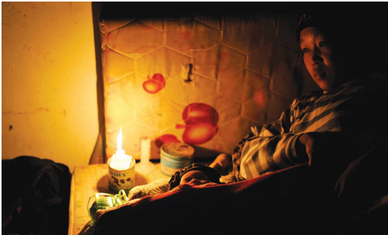
Ethnic Kachin mother and child displaced by ongoing war and abuses in Kachin Independence Army-held territory, Kachin State.