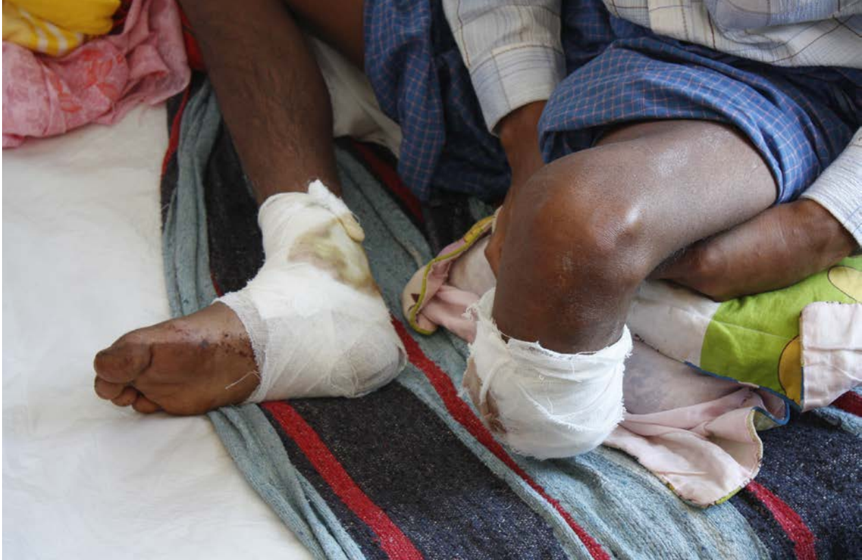
Ethnic-Kachin civilian injured by a landmine, Kachin State. The Myanmar Army and Kachin Independence Army have used landmines throughout Kachin State since June 2011.

crimes and crimes against humanity under international law. 110 Myanmar Army soldiers committed these abuses with impunity.