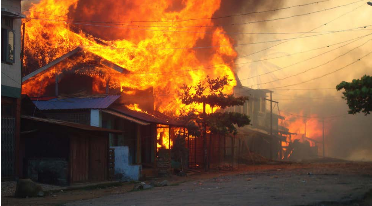
Muslim-owned homes and businesses burn, Narzi Quarter, Sittwe, June 2012. State security forces opened fire on Rohingya who attempted to extinguish the flames, killing scores.

the White House in May 2013. 28 Among these were commitments to have a more open and accountable government, to cease weapons trade with North Korea, to address the issue of political prisoners, to establish a ceasefire agreement in Kachin State, to invite the U.N. Office of the High Commissioner for Human Rights (OHCHR) to open an office in the country, and to take decisive action in Rakhine State. 29 To date, Myanmar has fully implemented only one of the 11 commitments: in 2013, President Thein Sein signed a U.N. nuclear protocol, addressing U.S. concerns about Myanmar trade with North Korea. 30