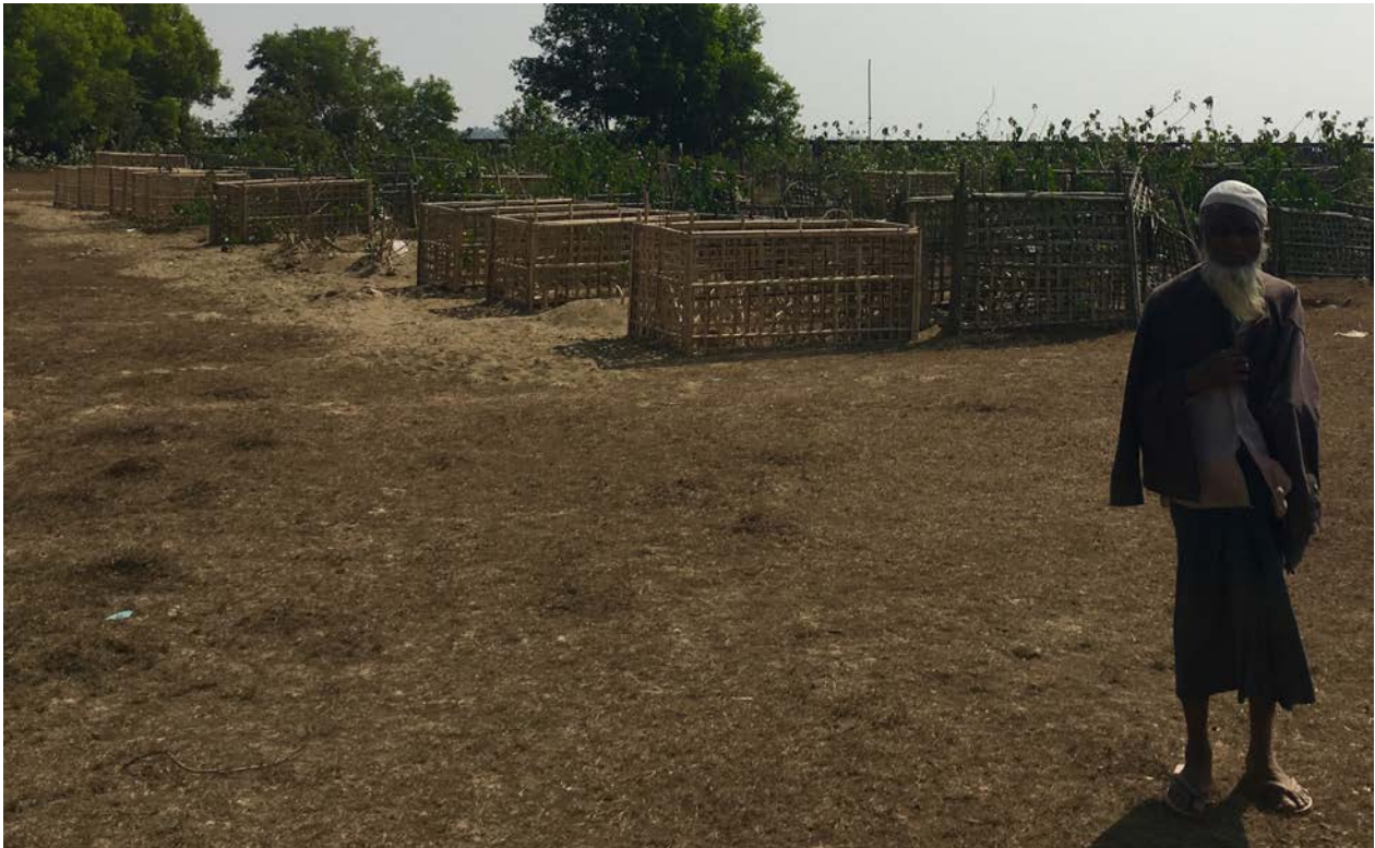
Local Imam responsible for burying the dead stands near growing corridor of gravesites in a Muslim internment camp, Sittwe Township.