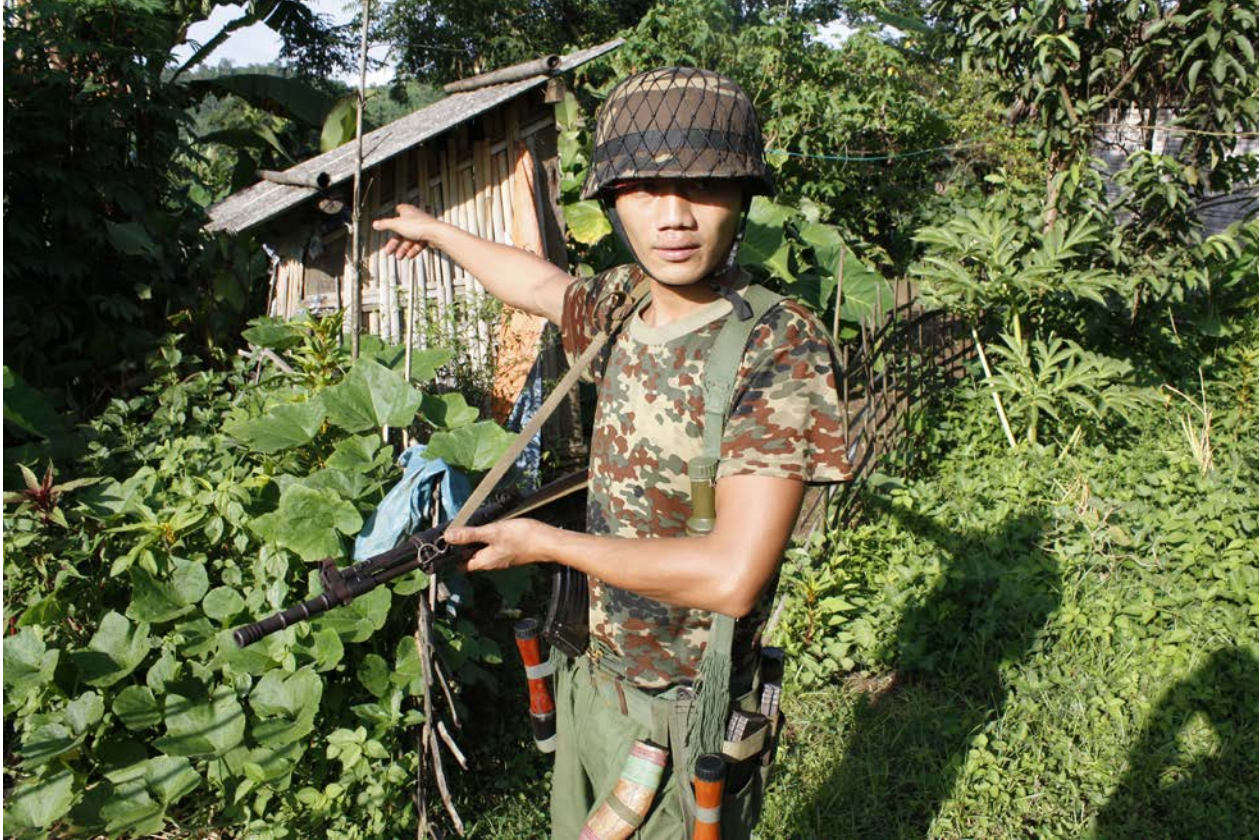
Kachin Independence Army soldier points in the direction of a nearby Myanmar Army outpost, Kachin State.

Behind the scenes, the military and military-owned businesses maintain outsized economic influence as well. For example, the military has long profited through the illicit and highly corrupt jade trade, which is directly connected to armed conflict and wartime abuses in Kachin State.