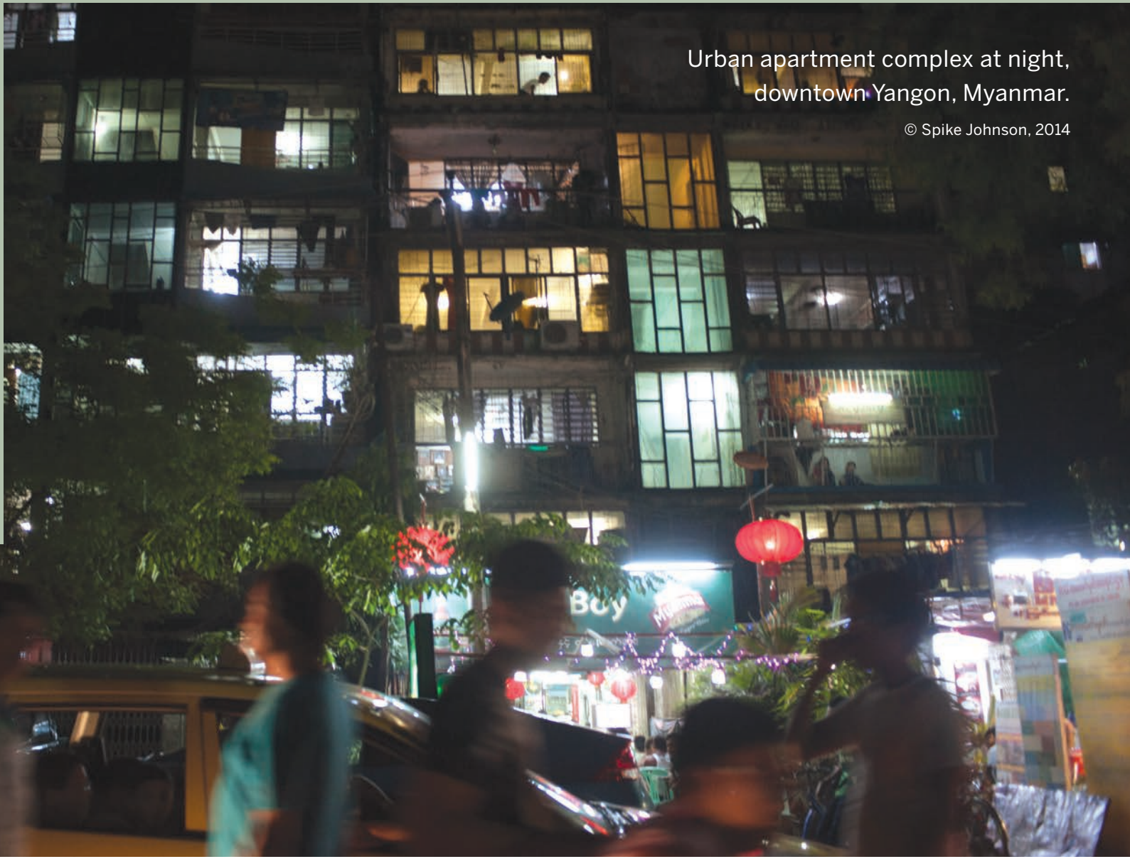
Urban apartment complex at night, downtown Yangon, Myanmar.