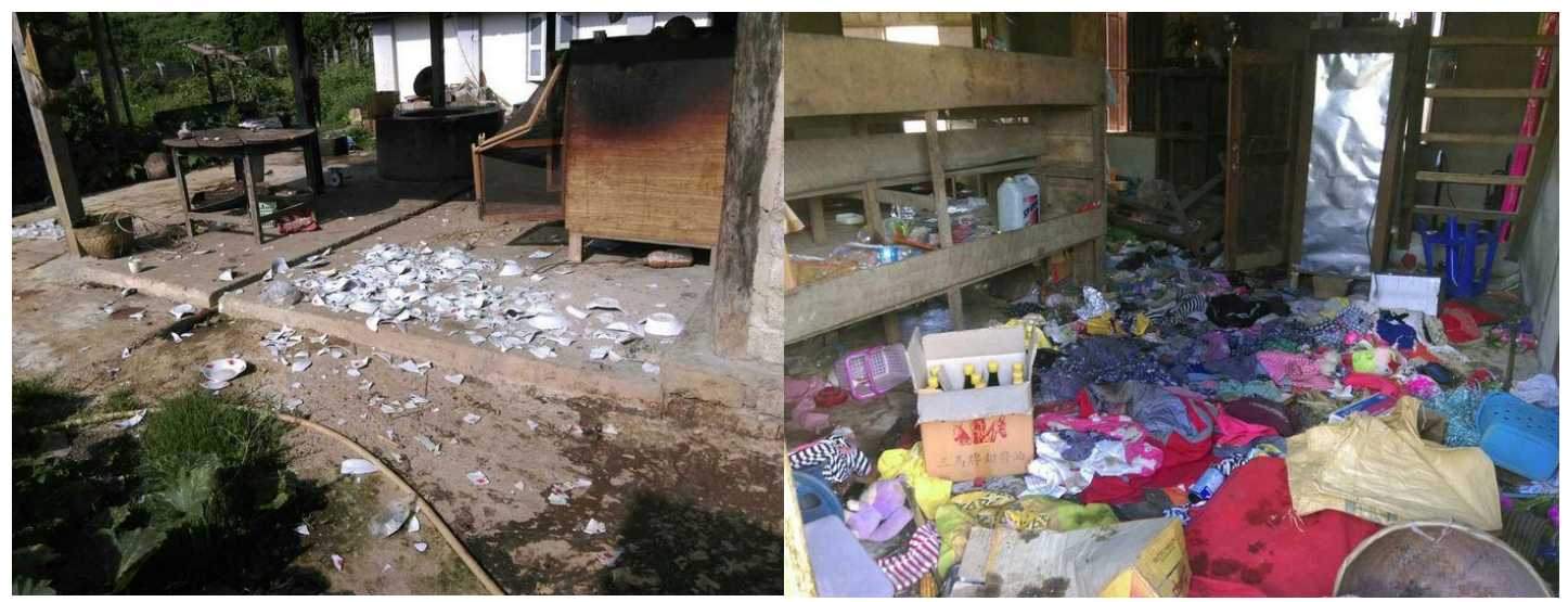
Villagers' possessions destroyed in Kho Nang Pha

During the offensive, the Burmese troops camped in local people's houses in Na Ma tract. They took whatever food they wanted from the houses. A villager from Pieng Hsai described this: "There were about 100 soldiers camped in our village. 22 soldiers slept in my house for three nights. They took our rice, salt and oil to cook for themselves. Fortunately there were no young women in the village. They had all fled when the fighting started."