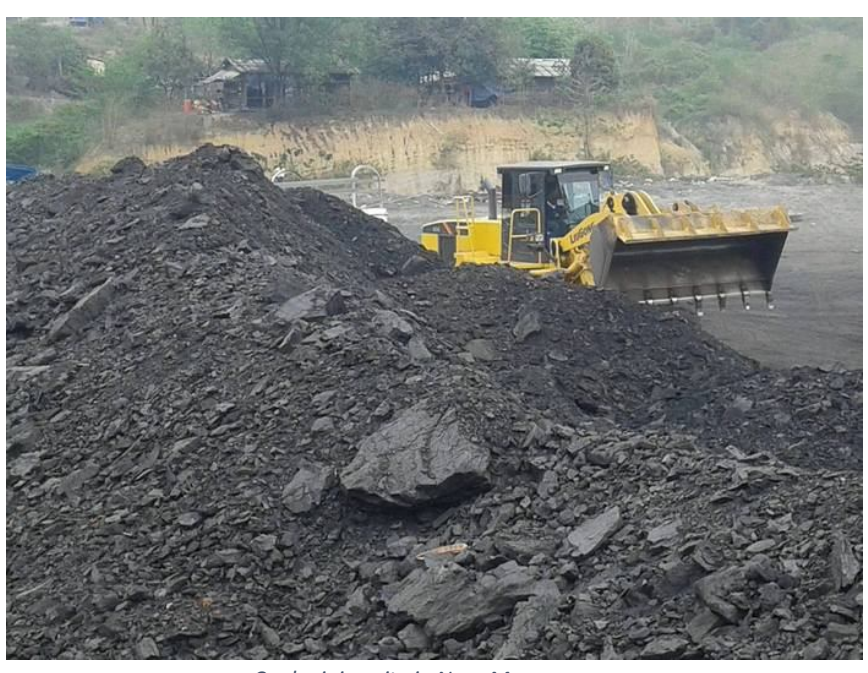
Coal mining site in Nam Ma area

On May 17, 2016, in response to villagers' complaints about the mining, some SSPP/SSA officers arrived in a convoy of trucks from their Wan Hai headquarters (100 kms to the south) to survey the Nam Ma mining area, returning to Wan Hai in the evening. The very next day, on May 18, the Burma Army began their offensive, targeting the three SSPP/SSA camps south of Nam Ma, despite the SSPP/SSA's existing ceasefire agreement with the government. The SSPP/SSA has now been forced out of the Nam Ma area, where it had been stationed for decades.