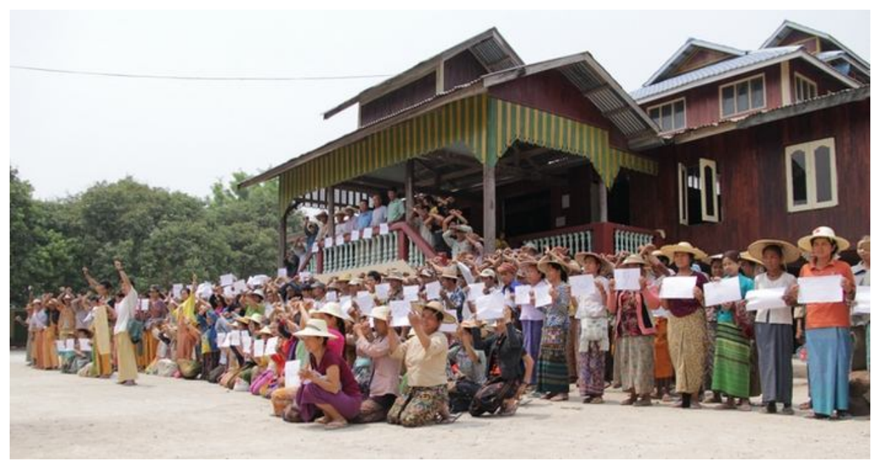
Villagers protesting against coal mining in Nam Ma area on April 1, 2016

The mining has destroyed farmlands, blocked and contaminated water sources, and caused air pollution, particularly impacting Pieng Hsai and Wan Long villages. Despite repeated complaints from local communities, Ngwe Yi Pale company has continuously expanded its mining operations. On April 1, 2016, hundreds of villagers gathered at the Nam Ma temple, calling for the mining to stop.