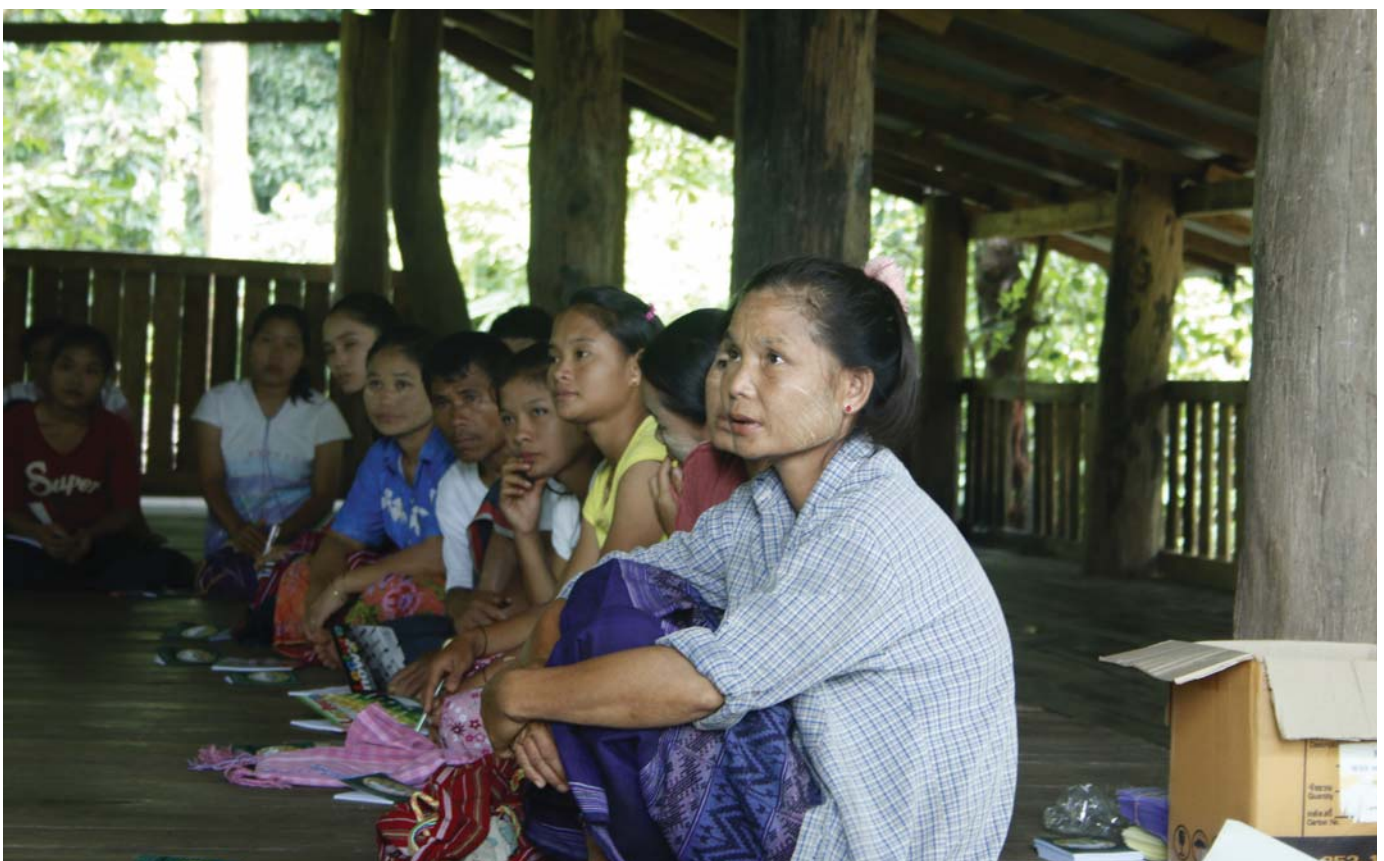
This photo shows women attending a KHRG workshop in N--- village, Wah Me Klah village tract, Painkyon Township, Hpa-an District in August 2015.

Naw A--- (female, 45), C--- village, Kawkareik Township, Dooplaya District/ southern Kayin State (interviewed in July 2015)