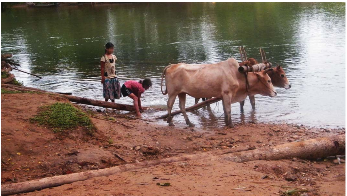
This photo was taken on October 10 th 2012, by a KHRG community member in K--- village, Day Wah village tract, Hpapun District. It shows two young girls engaged in a typical livelihood activity. The cows are pulling logs, which the girls will sell at the market.