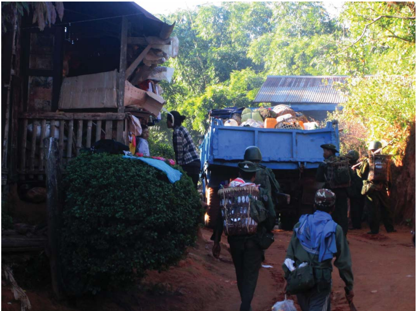
This photo was taken by a KHRG community member on December 1 st 2014, in J--- village, Htantabin Township, Toungoo District. It shows Tatmadaw soldiers from Military Operations Command (MOC) #5 moving through J--- village during a rotation. The soldiers were transporting rations to their frontline camp in Buh Hsa village.