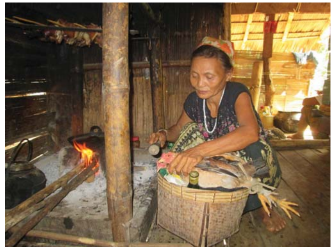
This photo was taken on April 28 th 2015 in B--- village, Meh Klaw village tract, Bu Tho Township, Hpapun District. It shows a villager taking part in a traditional spirit ceremony.

"I also feel bad [upset]. I was thinking to report it but I don't dare to. He will kill me if I do. If I submit the case [to the leaders], would he be okay? If I do submit the case to the leaders, he would tell me he will kill me for ruining his dignity. He would tell me that."