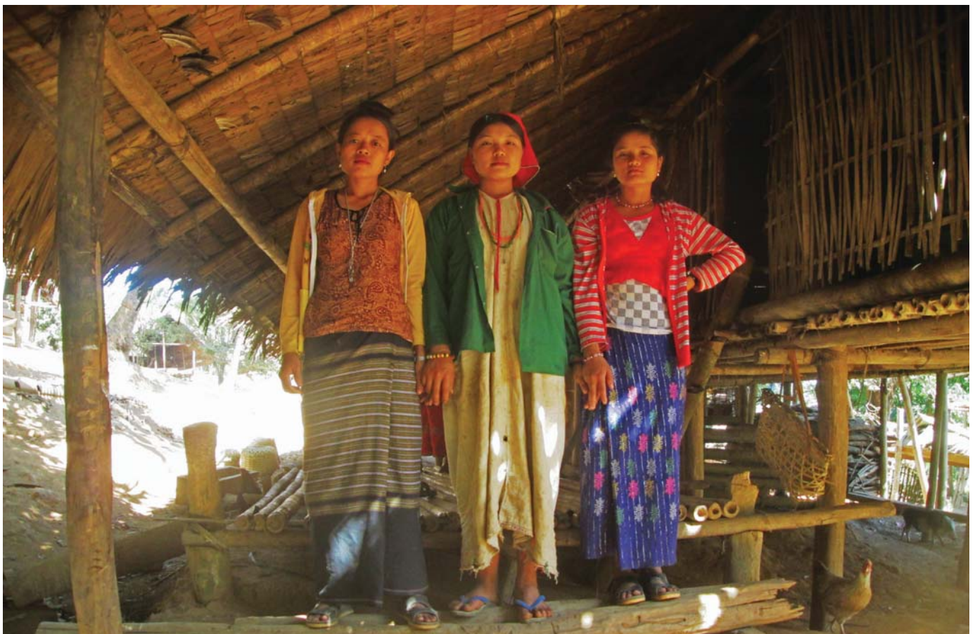
This photo was taken by a KHRG community member on January 23 rd 2015, in Meh Klaw village tract, Bu Tho Township, Hpapun District. It shows three friends after they had gathered to attend the middle woman's wedding.