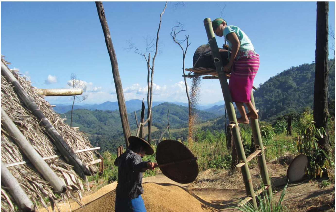
This photo was taken by a KHRG community member on November 13 th 2014, at a hill farm in H--- village, Daw Poo village tract, Hpapun District. It shows two women winnowing rice, an ancient technique which separates the grain from the chaff